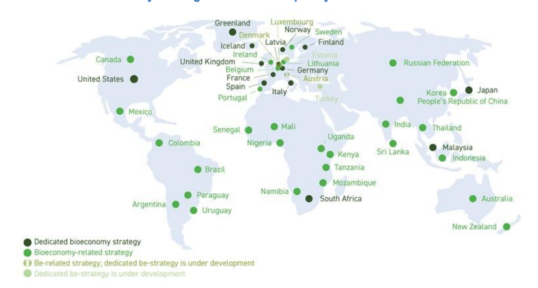
Figure 1. National bioeconomy strategies and related policy instruments.