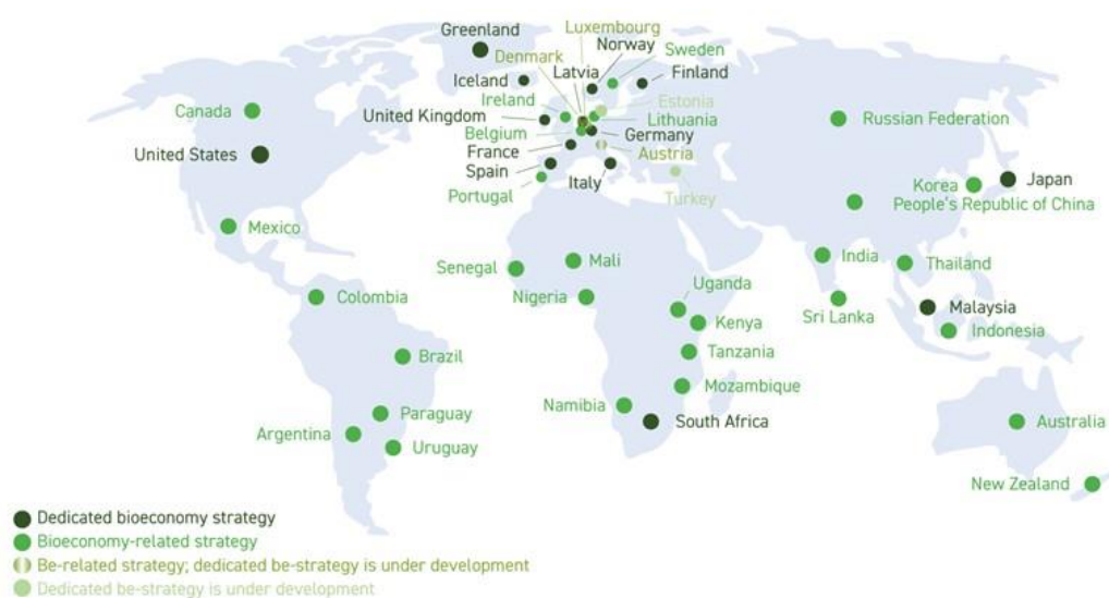
Figure 1. National bioeconomy strategies and related policy instruments.